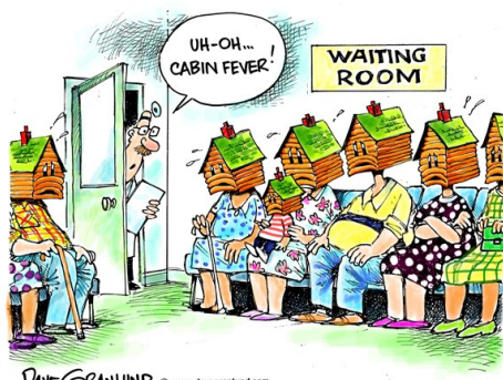
DAVE GRANLUND © www.davegranlund.com

FINE PRINT: You are on your honor to read books before marking a square off on your bingo card. Cheating, skimming, or watching the movie instead of reading the book, may invoke bad karma like running out of a favorite snack during a snowstorm, your least favorite candidate being elected, a hole in your snow boots, or someone banning your favorite book.